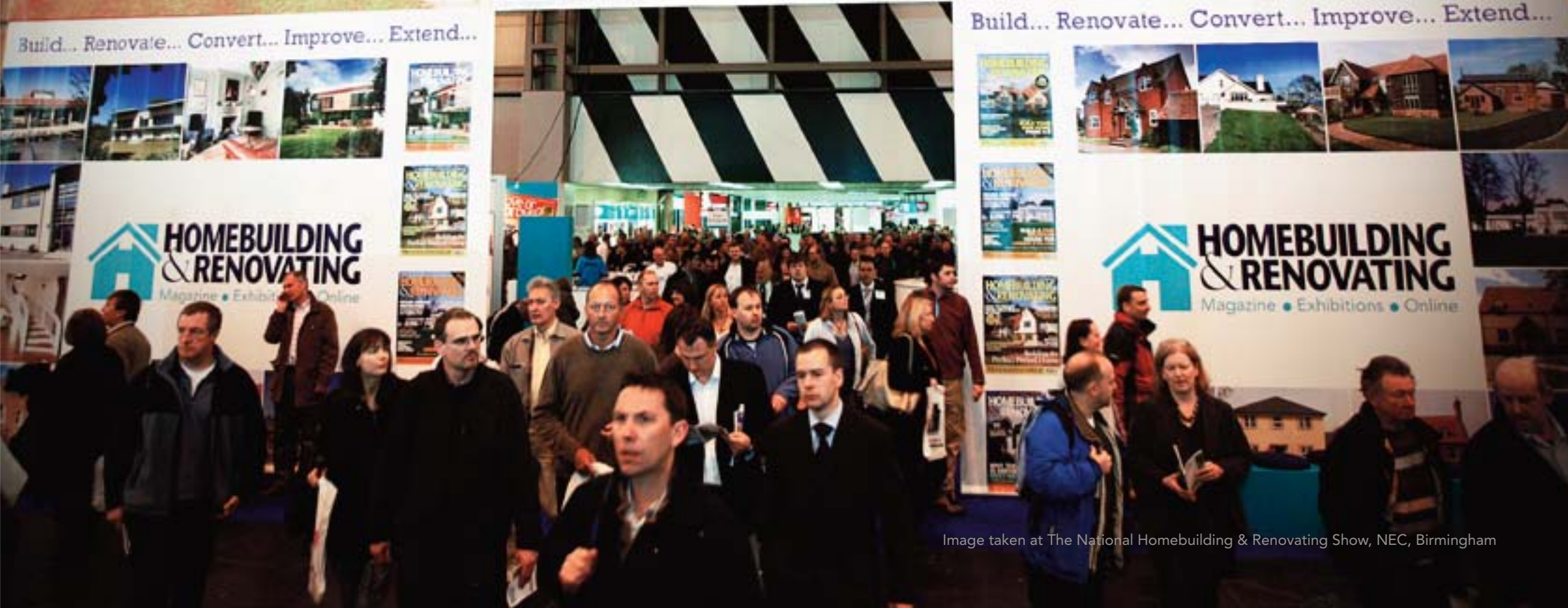
Image taken at The National Homebuilding & Renovating Show, NEC, Birmingham

HOMEBUILDING & RENOVATING Magazine • Exhibitions • Online