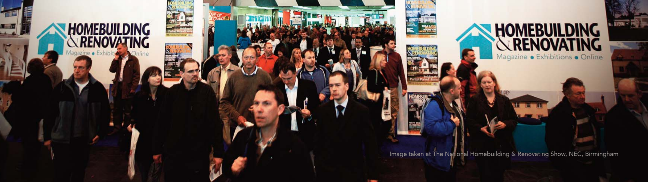
Image taken at The National Homebuilding & Renovating Show, NEC, Birmingham

HOMEBUILDING & RENOVATING Magazine • Exhibitions • Online